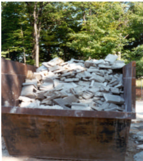
Figure 6. Concrete separated for recycling into new concrete. Waste audits identified need for new or different-sized containers, any contamination issues needing to be addressed, containers that needed to be moved or needed signs, etc.

We conducted site visits on a weekly basis at the beginning of the project and on a monthly basis later in the project once on site staff was familiar with the program.