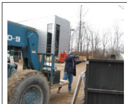
Figure 2. Crews reused and recycled 236 tons of material from the office expansion.

Affiliated Construction Services is the general contractor and Flad & Associates was the architect for this project. The Harley Davidson PDC Office building is a 75,000 ft 2 , two-story, steel-framed building with a pre-cast concrete and aluminum curtain wall. The curtain wall is primarily glass with some insulated metal panel accents. The entire roof is flat with a rock ballasted single-ply membrane. On the inside, a central corridor bisects the building. One half is primarily enclosed offices, conference and support spaces. There is a central receiving and mechanical area on the first floor. The other half is open office subdivided by a drywall partition into three large areas that can each accommodate 45 – 60 people.