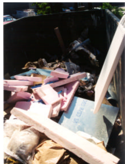
Figure 7. Trash dumpsters were placed nearest to construction to keep recycling dumpsters uncontaminated.

The crews kept the dumpsters free of contamination. It was also helpful to place the trash dumpster nearest to the building and the recycling dumpsters slightly further away. This allowed the default option to be trash – keeping the recycling dumpsters uncontaminated. However, the crews were also very diligent about keeping recyclables out of the trash dumpster. One exception was that boxes were commonly used as trash receptacles and then thrown away with trash inside them. Also, crews didn't always separate the recyclables from their lunch wastes. We got small recycling bins to place next to trash bins in lunch areas and this improved recycling of bottles and cans.