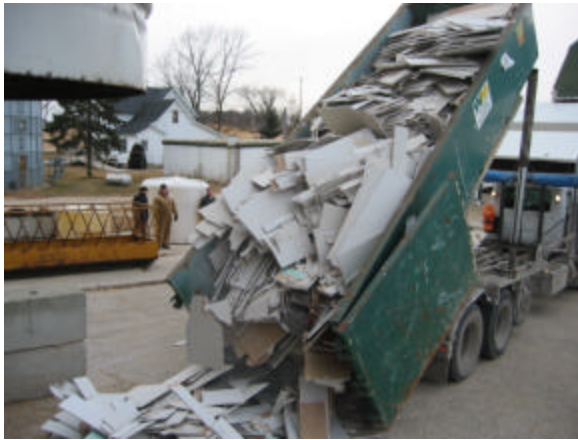
Figure 4. The first load of drywall at the farm. The drywall was used as a soil amendment.

WasteCap Wisconsin identified and worked with a local farmer who was interested in taking the scrap drywall as a soil amendment. Drywall, like agricultural gypsum, provides calcium and sulfur to soils and helps break up clay soils. The farmer's property was closer than the landfill, providing a cost benefit, and the farmer charged a tipping fee much lower than that at the landfill, providing further cost savings. We asked Waste Management, the hauler, to weigh the drywall at a scale which was on the way to the farm and then drop off the drywall at the farm. The farmer then stored the drywall until spring when he ground and applied the drywall to his fields.