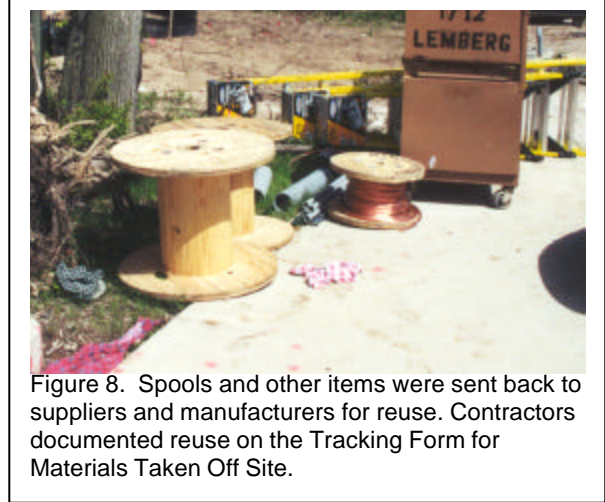
Figure 8. Spools and other items were sent back to suppliers and manufacturers for reuse. Contractors documented reuse on the Tracking Form for Materials Taken Off Site.

We wanted to track all materials leaving the site, whether they were in the dumpsters or taken by contractors, so that we could get an accurate accounting of total materials generated by this project. WasteCap created a Tracking Form for Materials Taken Off Site (see appendix B). All contractors were required to fill out this form and submit it monthly with their request-for-payment forms. Affiliated Construction Services then faxed the completed forms to WasteCap Wisconsin who tracked the results.