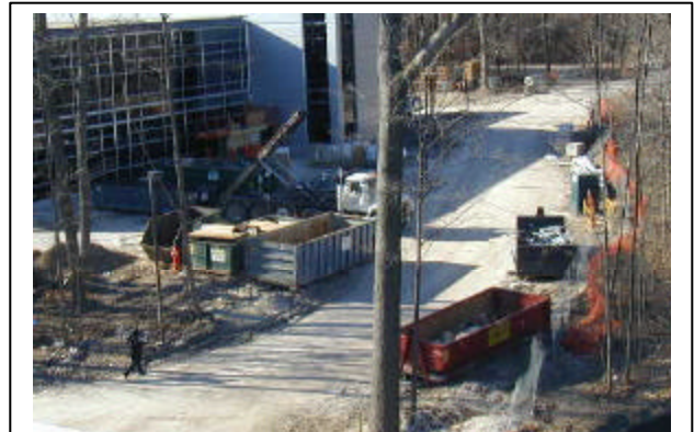
Figure 5. View of the dumpsters from the roof. WasteCap provided education to superintendents and foremen, on site staff including site superintendents and foremen provided day-to-day education and monitoring, and crews separated materials for reuse and recycling.

On July 31, 2002, Affiliated Construction Services held a contractor appreciation lunch. WasteCap thanked all of the crews and let them know what and why this job reused and recycled. We also reminded them of separation requirements. Initially, there was some confusion among crews about what they were supposed to separate, but after this and other education, all contractors and subcontractors did an excellent job of keeping recyclables clean and free from contamination and in considering waste reduction and recycling in their actions.