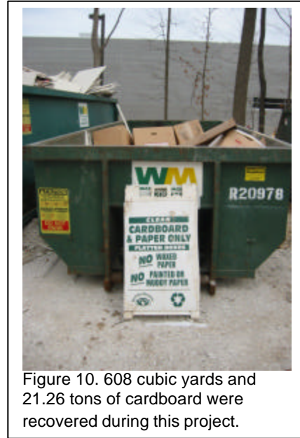
Figure 10. 608 cubic yards and 21.26 tons of cardboard were recovered during this project.

Table 1 shows a summary of waste and recycling results from April 2002 to March 2003. Concrete accounts for the highest proportion of recycled materials by weight and cardboard accounts for the highest proportion of recycled materials by volume. Wood also contributed significantly to the results.