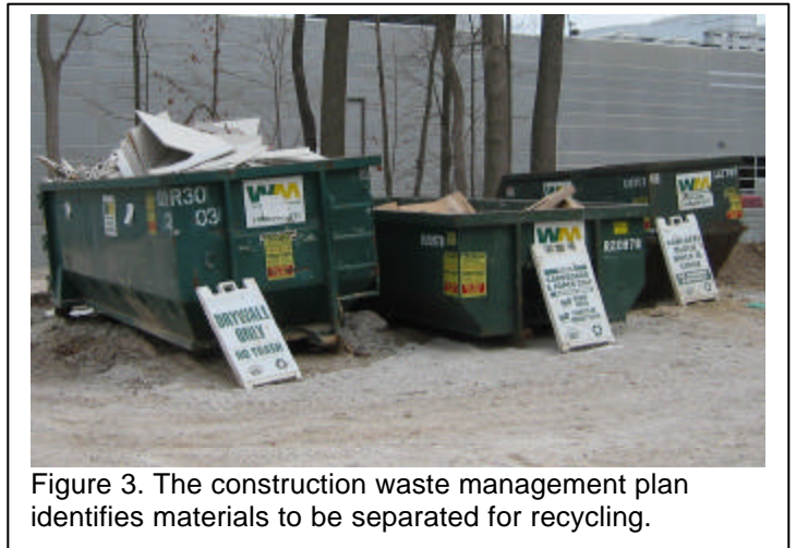
Figure 3. The construction waste management plan identifies materials to be separated for recycling.